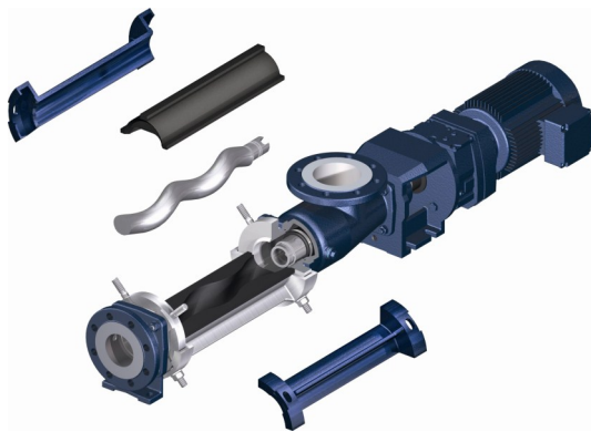
This exploded view of the BN range of pumps shows the seepex Smart Conveying Technology.

Specialist at seepex proposed their BN range of progressive cavity pumps which operate virtually pulsation free. This ensures that their sludge is transported evenly. With pumps of