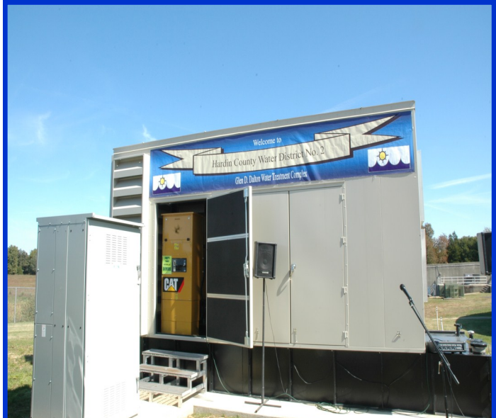
New 1,000 K generator unveiled at Hardin County Water District No. 2

Operations Manager Shaun Youravich said the new 1,000-k W unit will completely operate the water plant if electric goes out. Youravich praised the water treatment and distribution operators for their hard work in coming together to complete the project without any outside contractors. Operators installed all conduit, pulled all wire, formed & poured the concrete structure, made all electrical connections, and programmed the unit to run which resulted in a substantial saving to the water district and their customers. This project was a prime example of how operators can go the extra mile and make a difference!